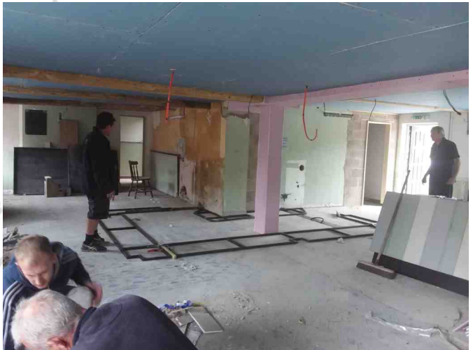
The new kitchen goes up