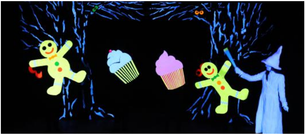
Above: The Magical Gingerbread Wood