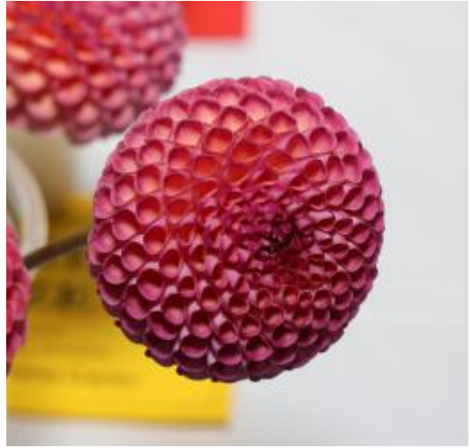
Above: A winning Dahlia. Right: A rainbow flower arrangement. Below: Vegetable judging in progress.

Thank you to our judges and the committee for all their hard work. Our AGM will take place on 30th October at 7.30pm in the village hall.