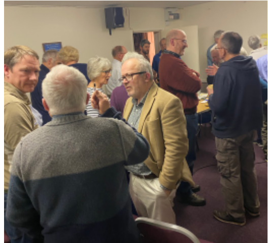
The well attended community meeting

attend the meeting but would still like to get involved or be kept informed about the work we're doing, please email coaleycan@gmail.com