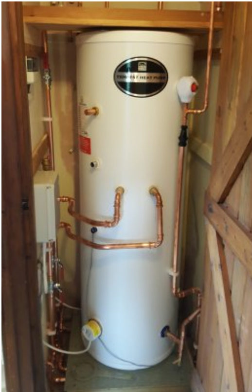
New hot water cylinder