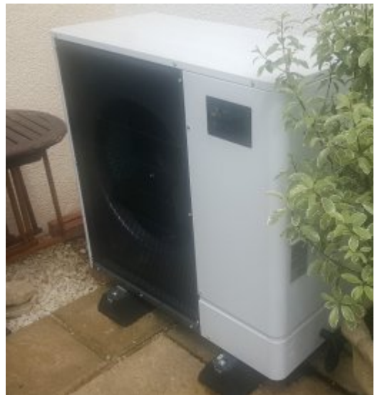
Air source heat pump outside unit.

Fortunately, the Government Renewable Heat Incentive(RHI) is still available which helps to pay back most of the capital cost over 7 years when the reduction in electricity consumption is also taken into account. GSM first