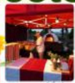
Megabite wood fired pizza

fresh hand made Pizza from Mama's Woodfired Pizza